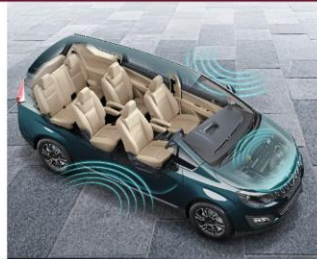
Quietest cabin in its class