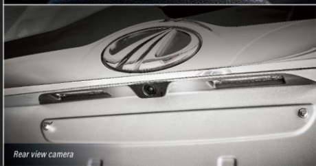
Rear view camera