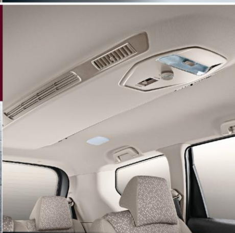
Industry 1 st Surround Cool Technology