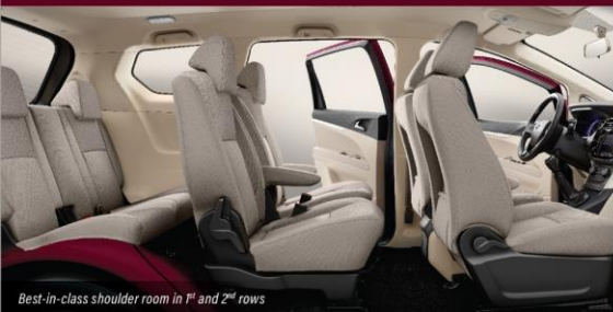
Best-in-class shoulder room in 1 st and 2 nd rows