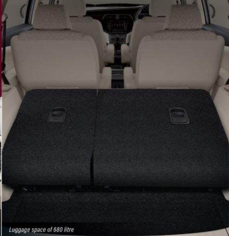
Luggage space of 680 litre