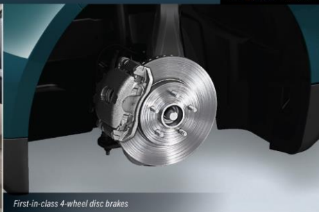
First-in-class 4-wheel disc brakes