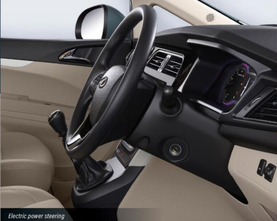
Electric power steering