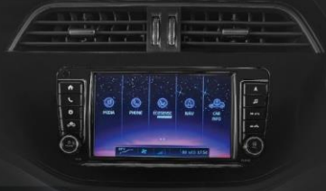
17.78 cm touchscreen infotainment system