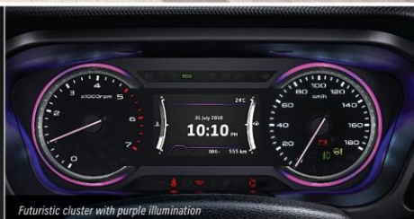
Futuristic cluster with purple illumination