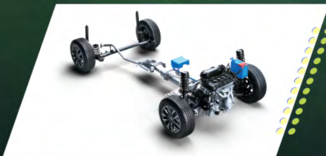
Advanced Lithium Ion Battery with ISG (on AT variants)*6