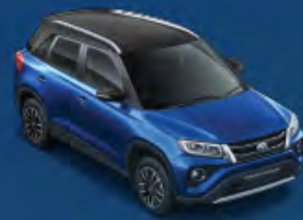
● SPUNKY BLUE WITH SIZZLING BLACK ROOF