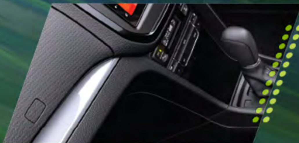
Choice of MT, AT transmission on all grades