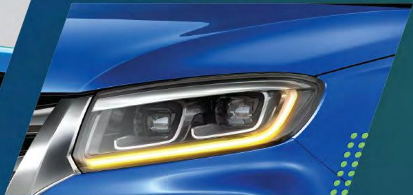
Dual Function LED DRL and Turn Indicator in Headlamps