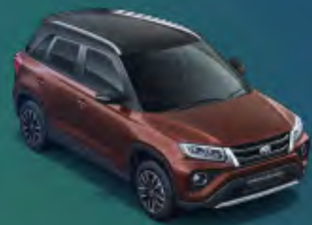
● RUSTIC BROWN WITH SIZZLING BLACK ROOF