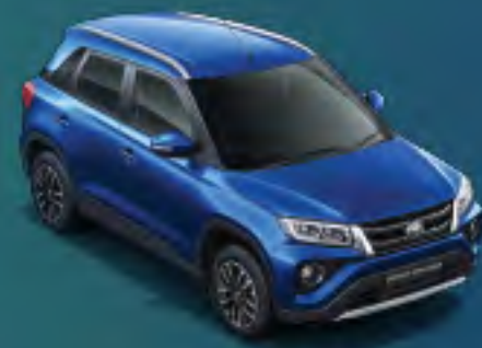
● SPUNKY BLUE