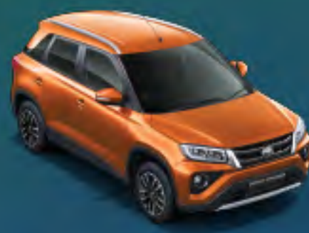
● GROOVY ORANGE