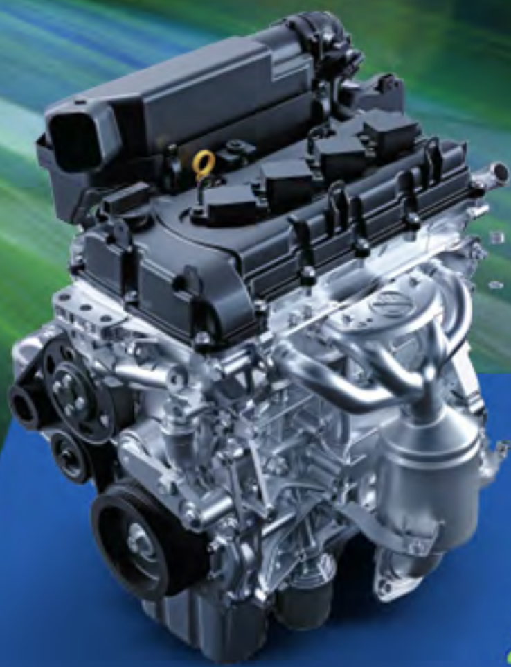
All-new Powerful K-series 1.5L, 4-Cylinder Gasoline Engine