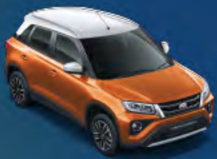
● GROOVY ORANGE WITH SUNNY WHITE ROOF