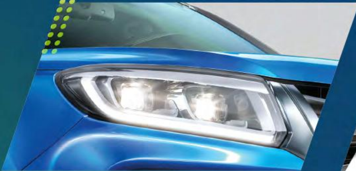
Dual Chamber LED Projector Headlamps with Chrome Accents