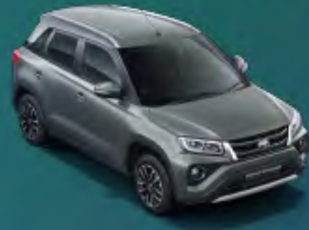
● SUAVE SILVER