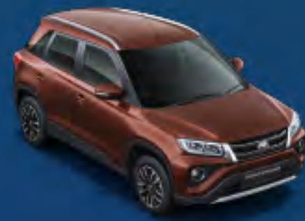
● RUSTIC BROWN