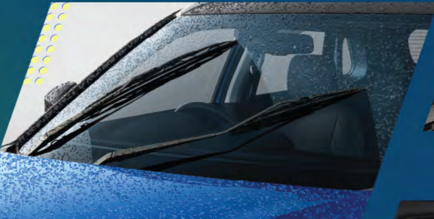
Auto Rain-Sensing Wipers