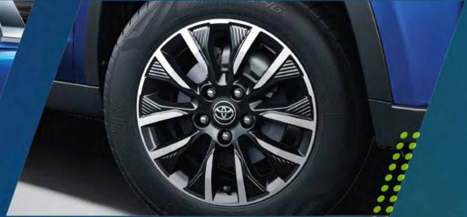
R16 - 40.64 cm Diamond-Cut Alloy Wheels