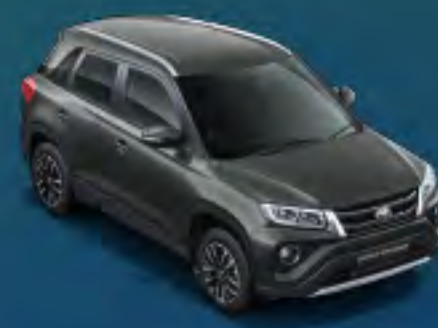
● ICONIC GREY