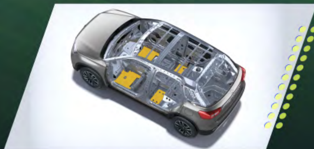
Advanced Rigid Platform