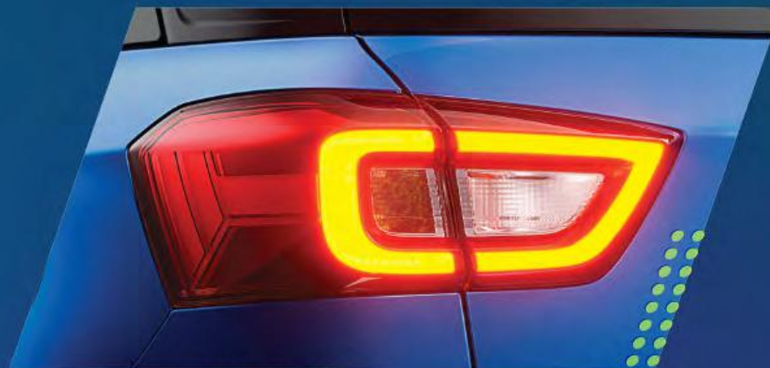
Split LED Rear Combination Lamps