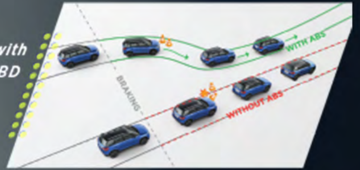
ABS with EBD