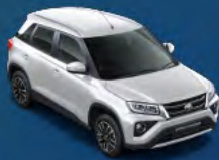
● SUNNY WHITE