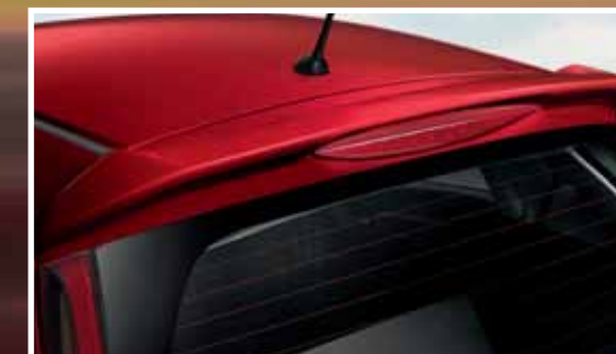
Tail Gate Spoiler