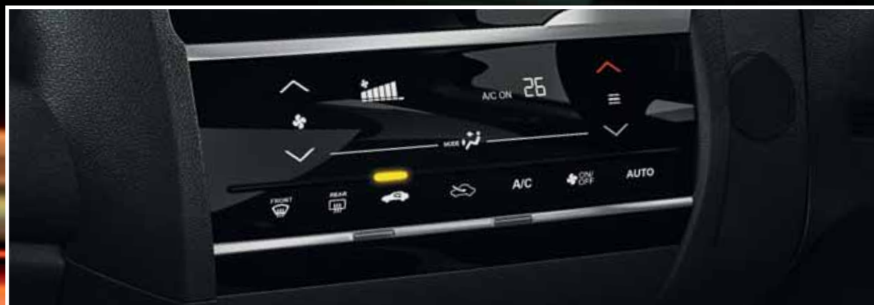
Auto AC with Touchscreen Control Panel