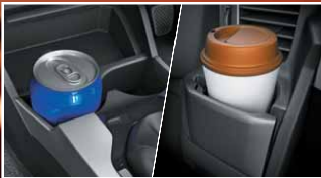
Central Console Cup Holders