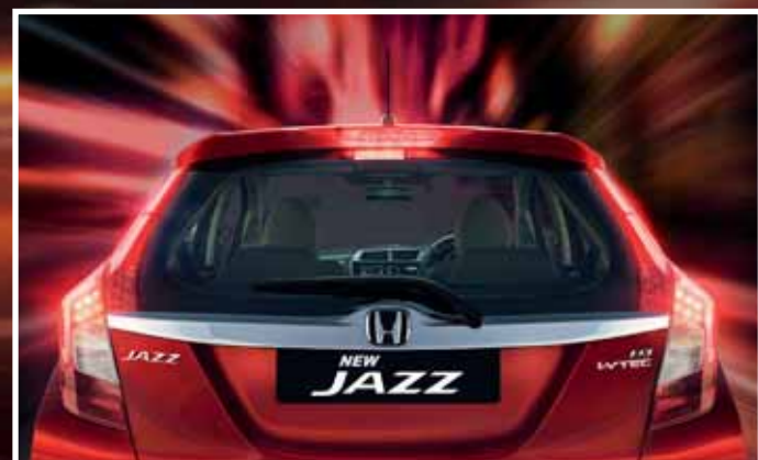
Signature Rear LED Wing Lights