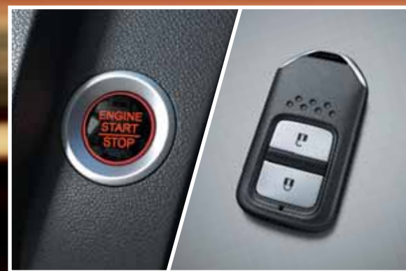
One-Push Start/Stop Button with Smart Key