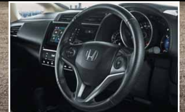
Steering Wheel Cover

*Utility Package Includes - Front Bumper Corner Moulding, Rear Bumper Corner Moulding, Body Side Moulding, Door Handle Protector and Door Edge Garnish.