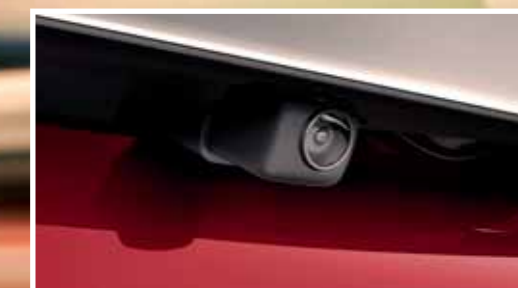
Rear Parking Camera