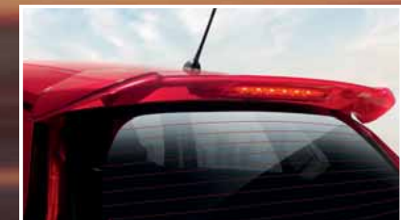
Tail Gate Spoiler with LED