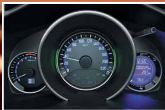
Advanced Multi-Info Combi Meter