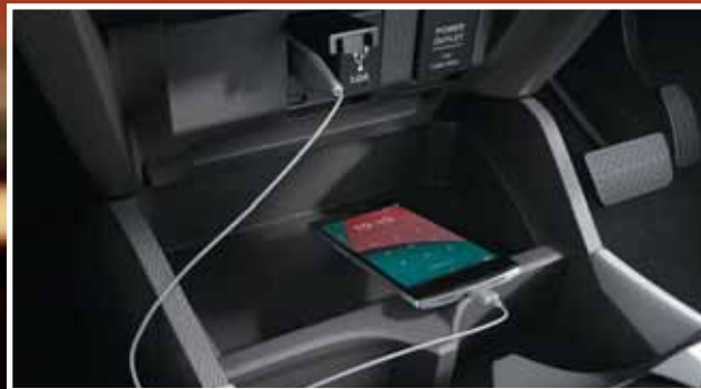
Central Console Power & USB Ports