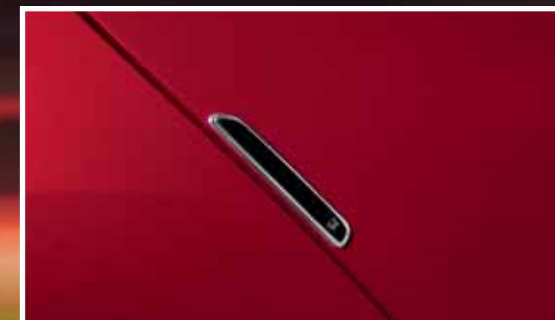
*Door Edge Garnish

to protect your New Honda Jazz and keep it looking as good as new.