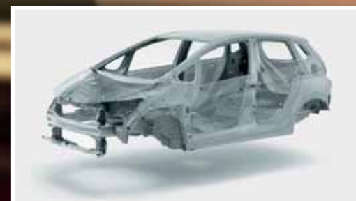
ACE™ Body Structure