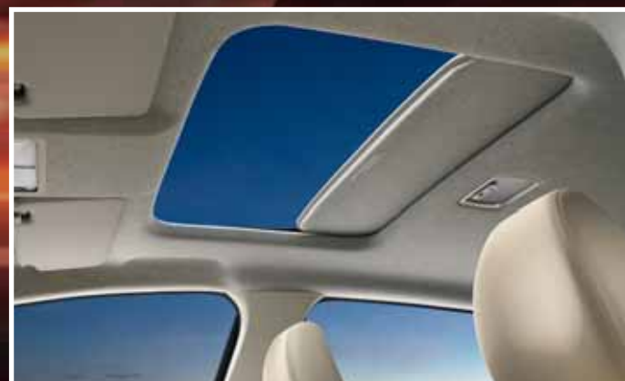
One-Touch Electric Sunroof