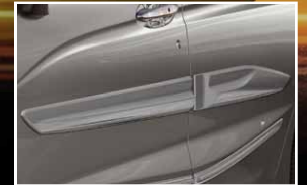
Body Side Moulding