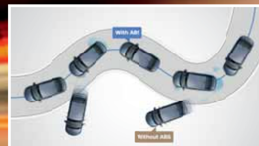
ABS with EBD