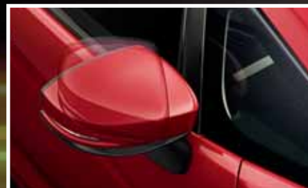
Electric Mirror with Turn Indicator

If one word could describe you, it is 'demanding'. Your penchant for going above and beyond is second to none, expecting nothing less from things around you. Like a sunroof in a hatchback, or the smoothest in CVT. The fact that you expect the absolute best in everything you do proves that the New Honda Jazz is made just for you. It is