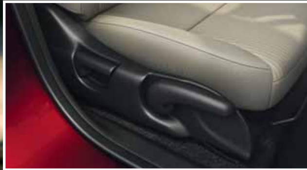
Driver Seat Height Adjuster