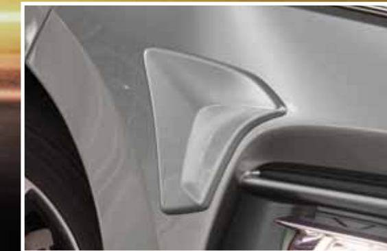
*Front Bumper Corner Moulding