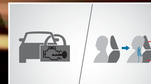
Immobilizer Anti-theft System