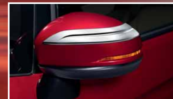
Door Mirror Garnish