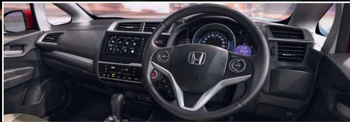
Hands-On Intelligent Steering (Audio, Hands-Free, Paddle Shift & Cruise Control)