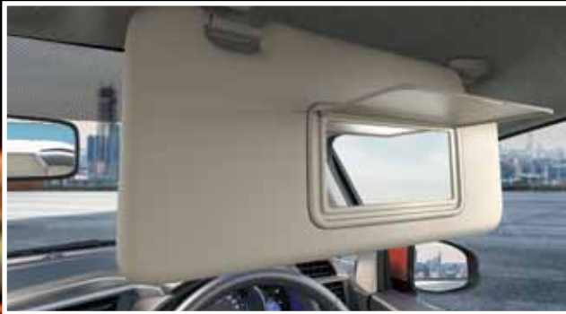
Driver Vanity Mirror