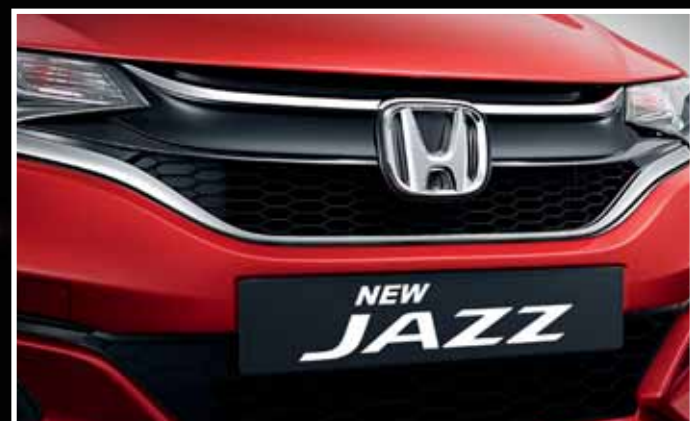
Chrome Accentuated High Gloss Black Grille