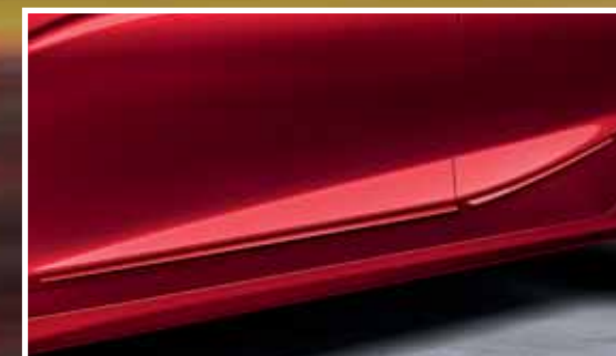
*Body Side Moulding