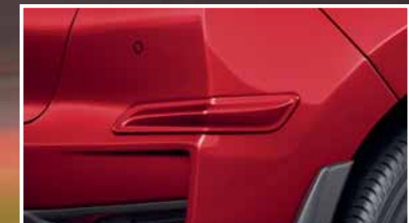
*Rear Bumper Corner Moulding