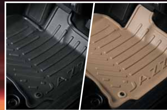
Bucket Mat (Black/Beige)