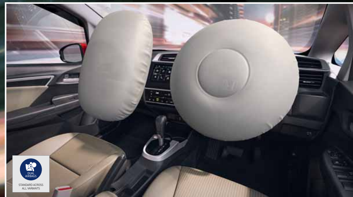
Dual Front SRS Airbags (Driver & Passenger)

The New Honda Jazz is equipped with safety features like Standard Dual SRS Airbags, ABS with EBD and Rear Parking Sensor with Camera amongst others. ACE™ Body Structure and pedestrian injury mitigation technology minimize injuries in the event of a collision. Safe to say, the New Honda Jazz has got you covered, even on the things you never demanded for.