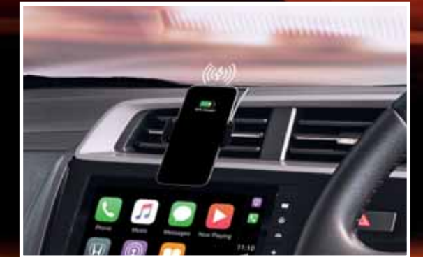
Wireless Charger (with Smartphone Holder)

No demand of yours is too small, and we have every little addition for you to make the New Honda Jazz your very own. From the classy spoiler and dapper perforated steering cover, to mudguards and bumper mouldings that make your ride even more safe, to plush, stylish seat covers that add to a sense of comfort and luxury. With each additional accessory, you can personalise the New Honda Jazz to live up to your every demand.