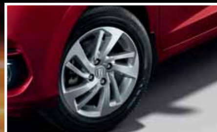
R15 Alloy Wheels