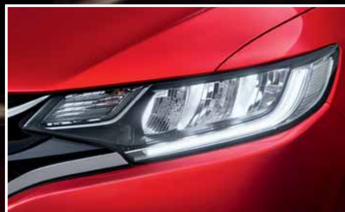
Advanced LED Headlamps (Inline Shell) with DRL