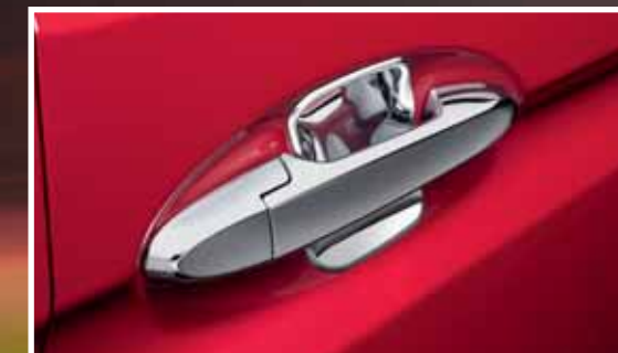
*Door Handle Protector