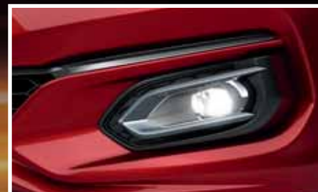
Advanced LED Fog Lamps