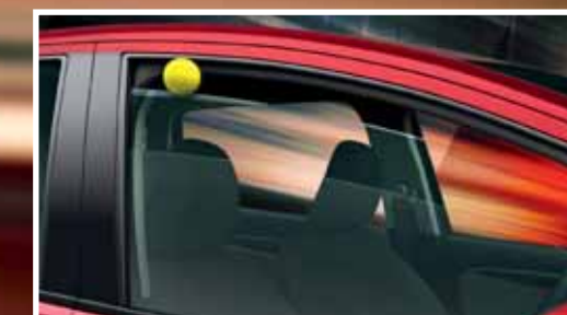
Driver Side Window One-Touch Up/Down with Pinch Guard